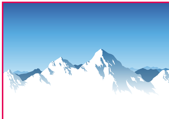
2 Samuel 22 – David's Song of Praise