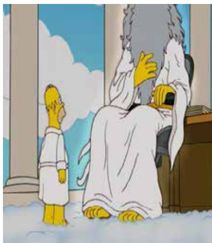
Image from The Simpsons , 'Thank God, It's Doomsday'.

Images of God, Faith, Relationship, Trust, Trinity, Old Testament, New Testament, Fortress, God, Love, Prayer, Good Shepherd, Father, Mother, Hope, Learning.